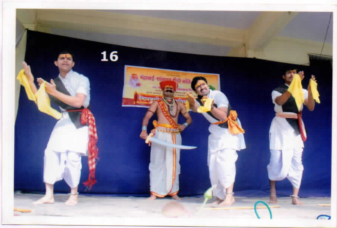
Students performing Folk Songs