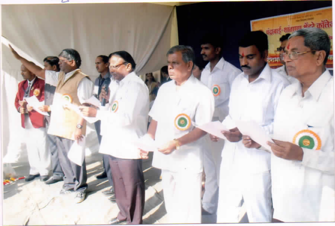
Oath Taking Ceremony on the occasion of Republic Day 26 th Jan.