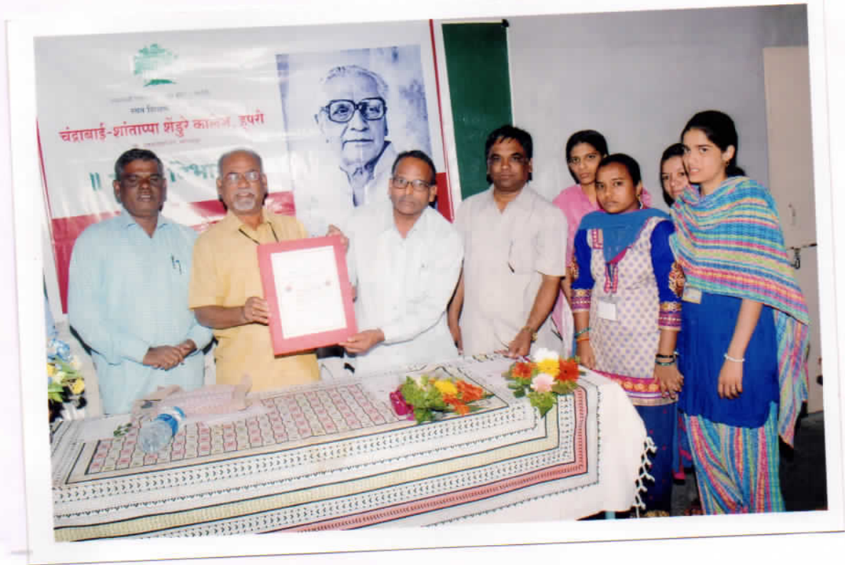
Publication of kusumanjali Manuscript