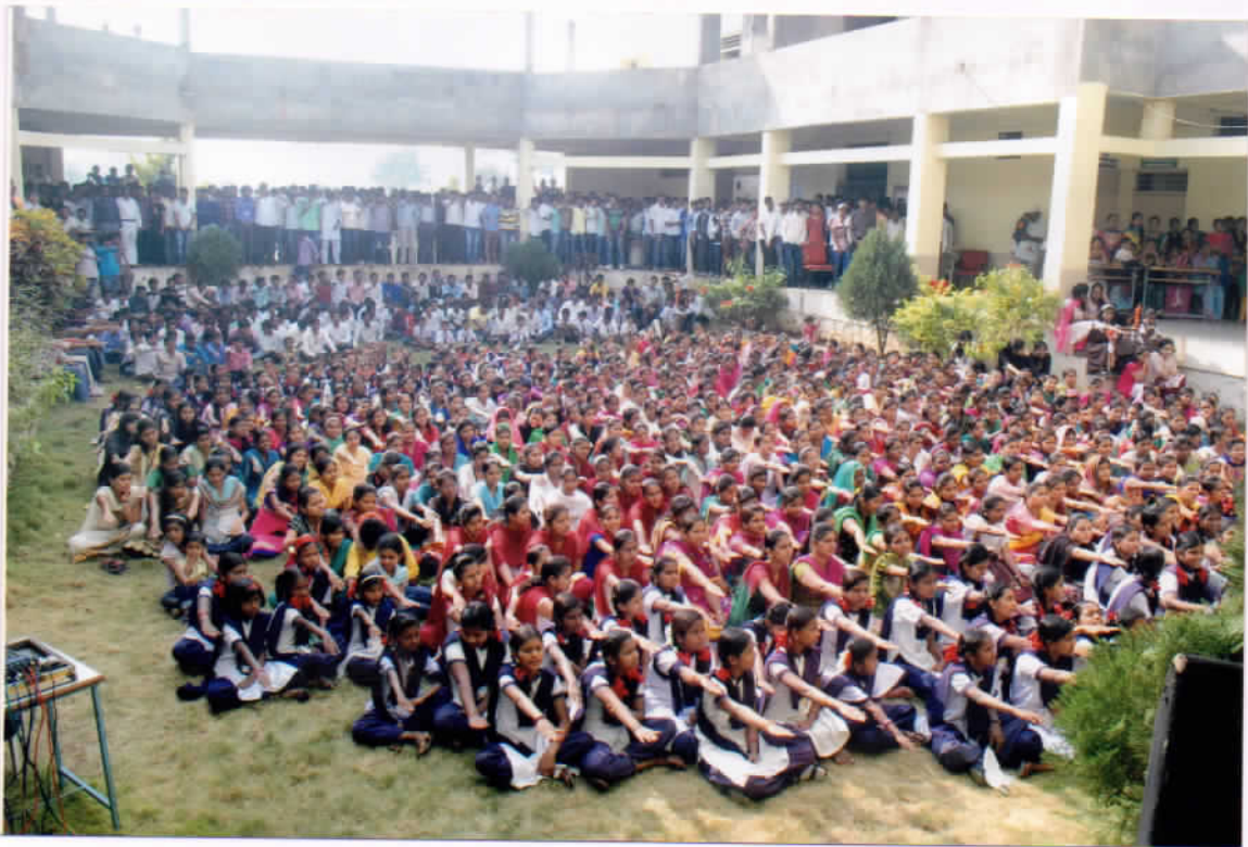
Oath Taking Ceremony of Preamble of Indian Constitution on Republic Day 26 th Jan